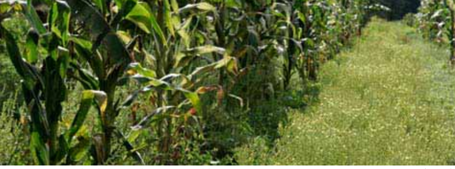
Overgrown weeds always reduce crop yields

It is important to use a combination of methods to control weeds. Organic farming promotes the use of sustainable methods of weed control that do not damage or pollute the environment. Below are some of the methods that farmers can adopt to ensure weeds do not become a threat to their crops. Poor weeding methods