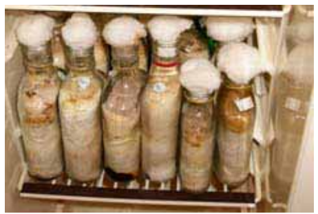
Mushroom spawn in a lab

In December last year, she enrolled for a course in mushroom production at the Ngong Farmers Training College and got further training from the Juja Pledge Centre. On completion she immediately went into mushroom production. The two houses she had used for fodder storage were prepared for both incubation and fruiting of mushrooms. She harvested 15