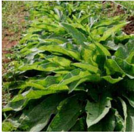
Comfrey at the edge of a garden

Liquid feeds can be made using comfrey or nettle leaves. Comfrey leaves are rich in plant nutrients. The leaves decay rapidly, releasing the litres of water. goodness they contain. They can also be used as a mulch or compost activator. The leaves are slightly alkaline, Nettles so the feed should not be used on acid-tolerant plants. Comfrey liquid water. is high in potash and has reasonable levels of nitrogen and phosphate. It is • Use after two weeks.