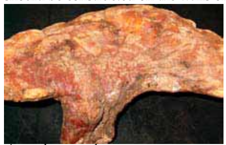
A ganoderma mushroom

Seeds: Mushroom seeds are called spawn- these are very small cells or spores that develop into the mushroom when put in the right environment for germination. Spawn was previously imported from developed countries, but a number of local institutions are currently producing it. The JKUAT produces high quality spawn because they have the latest equipment in their spawn laboratory. Production structure: The farmer can make a thatched mud-brick room of any size, depending on the amount of mushrooms they intend to produce. In order to keep the costs down, it is advisable to use local material that can make an ideal structure. Shelves should be constructed on the walls of